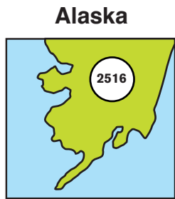
Sales Northwest Inc.